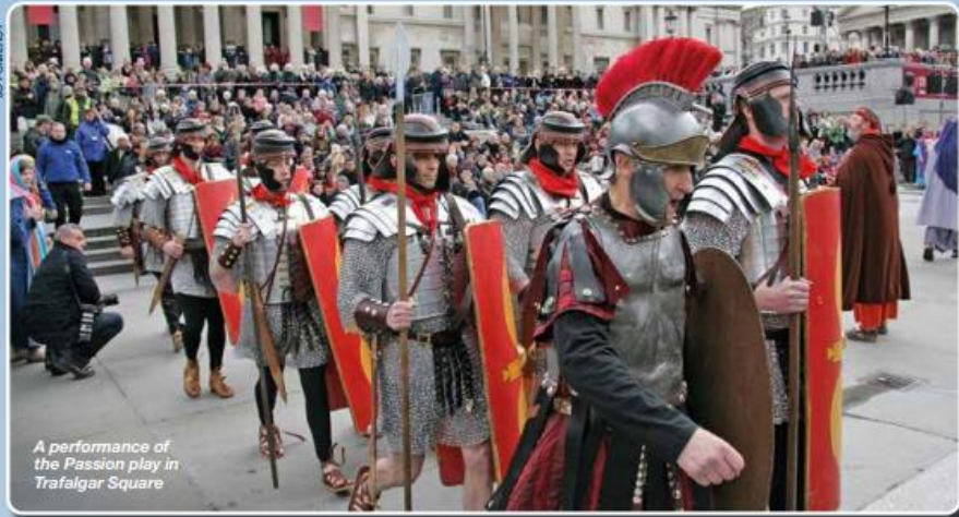
A performance of the Passion play in Trafalgar Square